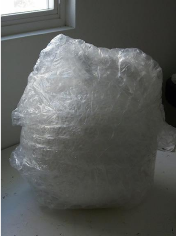
Bundle of Joy

100 oranges will be painted by local artists and awarded to sponsors by raffle. It's my first time painting on fiberglass, and I'll be painting an entire dawn sky 'inside out'.