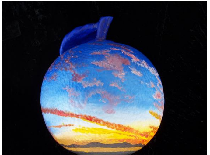
The north-east aspect.